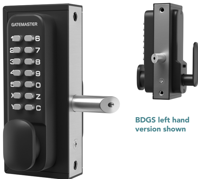
BDGS left hand version shown