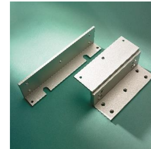
AEMBR026 Z&L Bracket to suit Inward Opening Doors