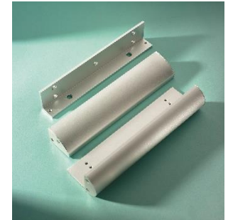
AMH590/ZA Architectural Z&L Bracket to suit Inward Opening Doors